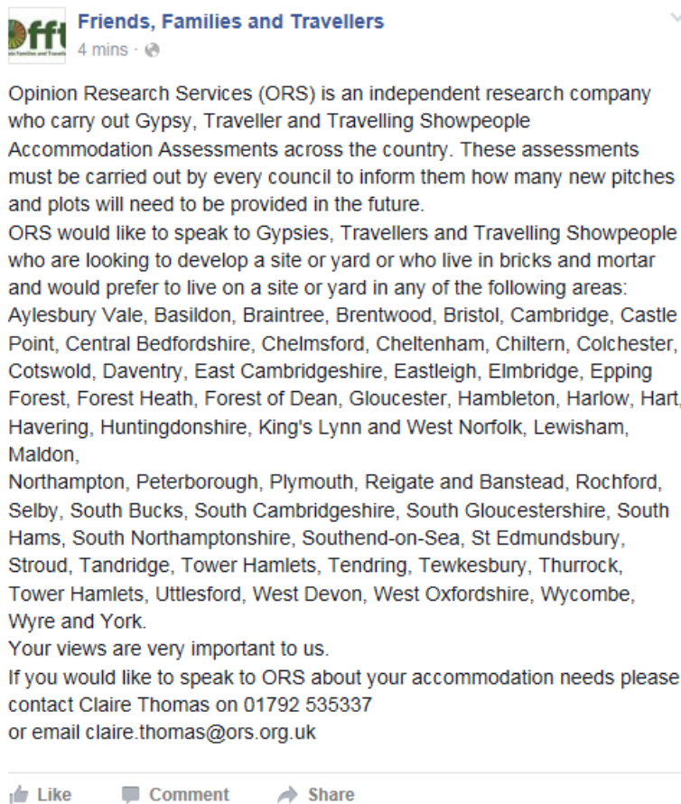
Figure 14 – Bricks and Mortar Adverts